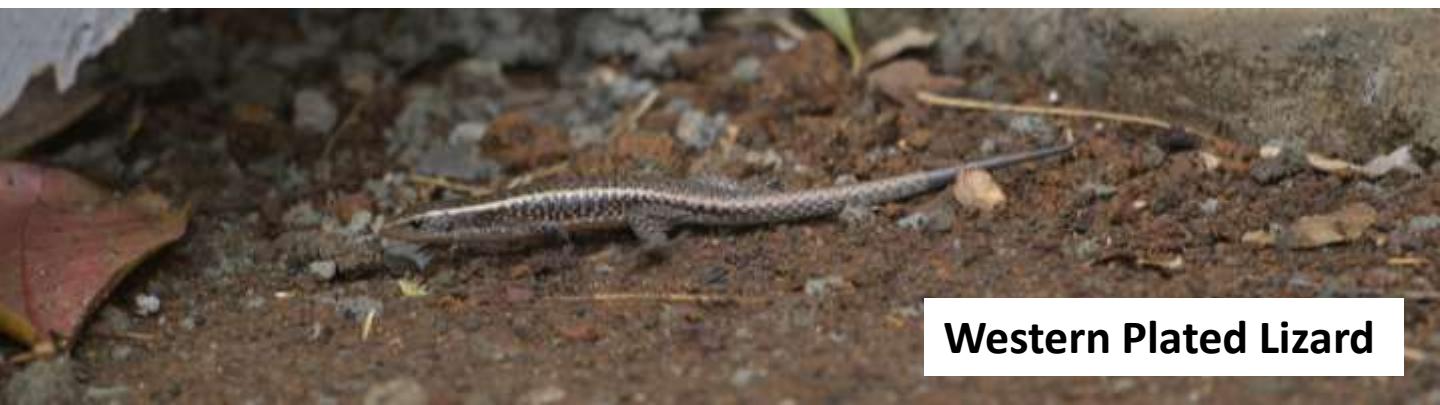
Western Plated Lizard

L'Heure Bleue (Nosy Be), a luxurious hotel with bungalows, WiFi in the rooms, good food, limited wildlife in the grounds but the location on the beach gives good view for watching passing wildlife