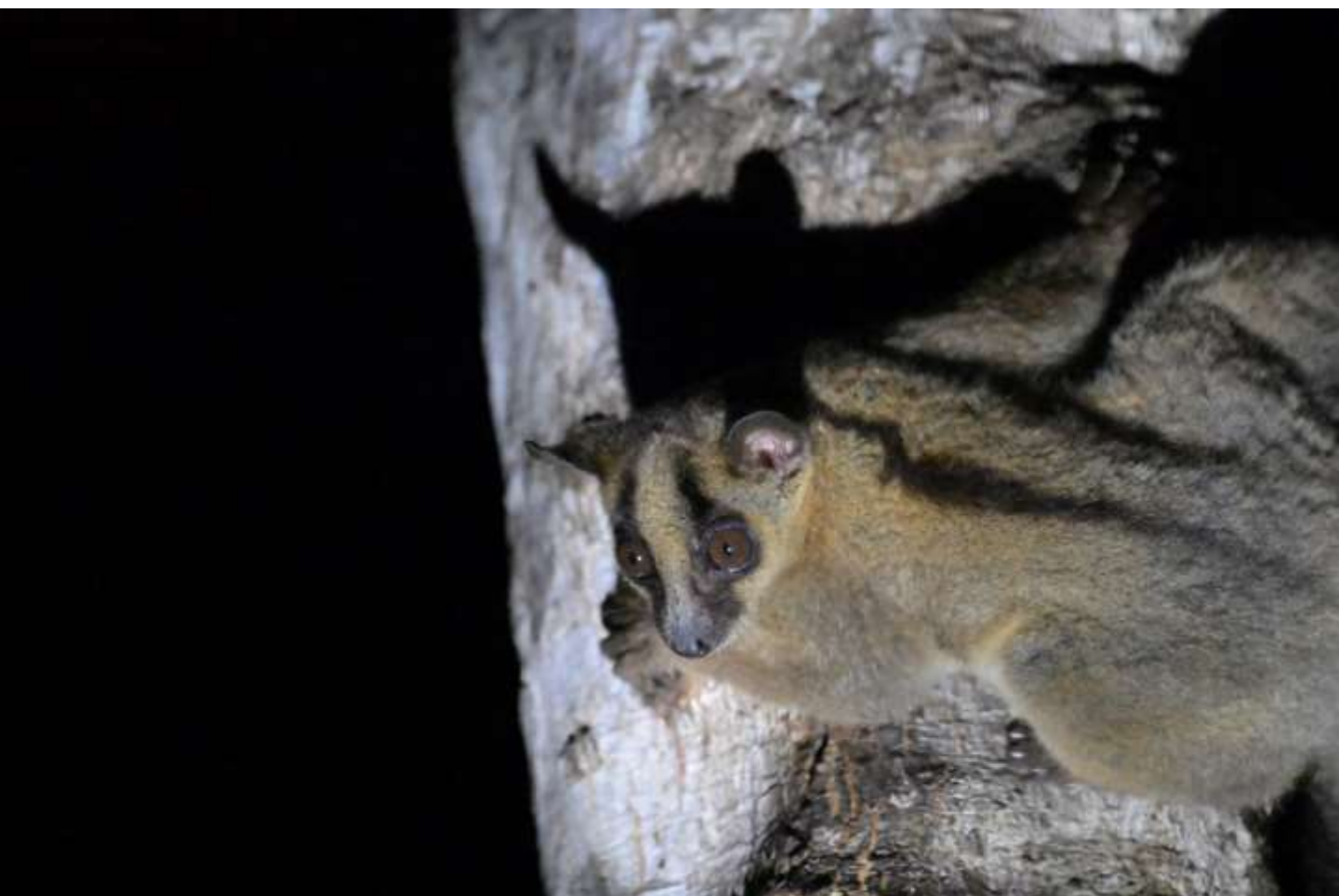
Pale Fork Marked Lemur

I had set the moth trap running before we left and it was quite busy on my return with a nice selection of moths of all sorts of shapes and sizes.