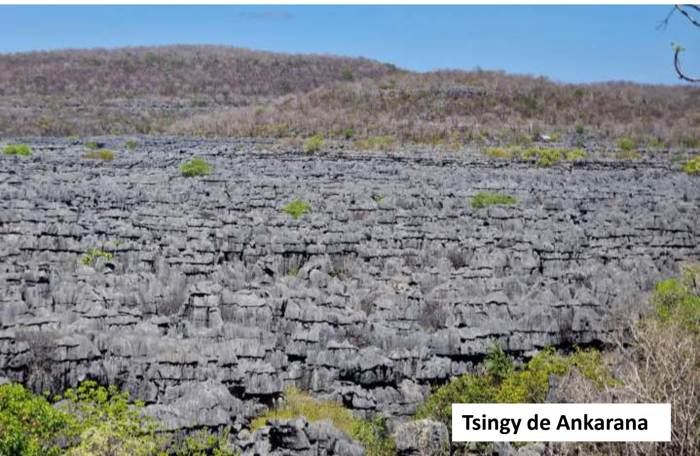
Tsingy de Ankarana

The moth trap held a nice selection of moths.