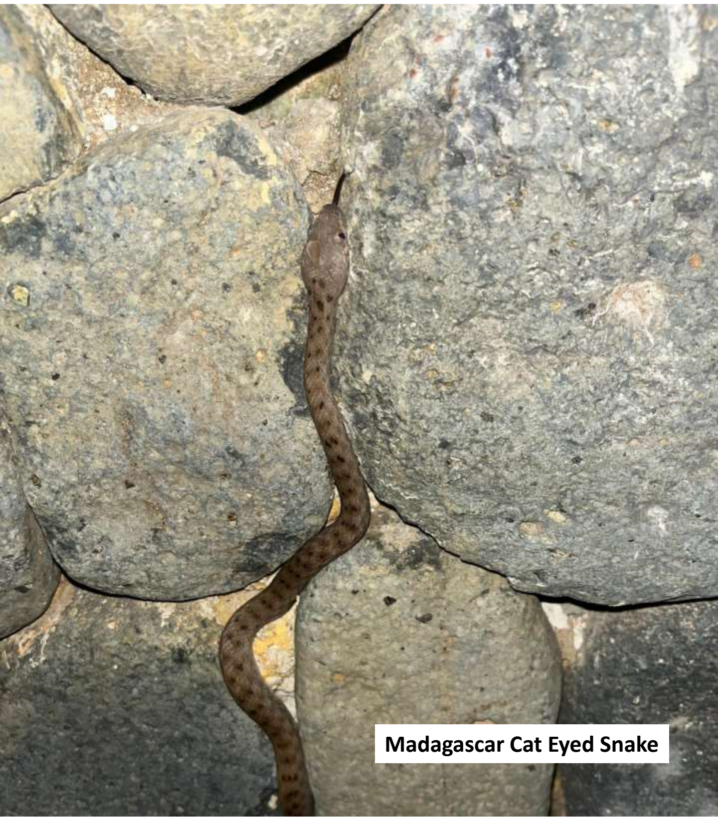
Madagascar Cat Eyed Snake

The moth trapping was disappointing mostly beetles and some flying ants so I packed up early and avoided the storm that arrived from nowhere.