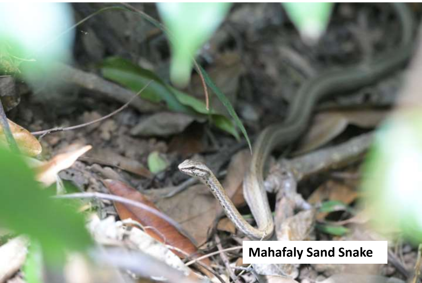
Mahafaly Sand Snake