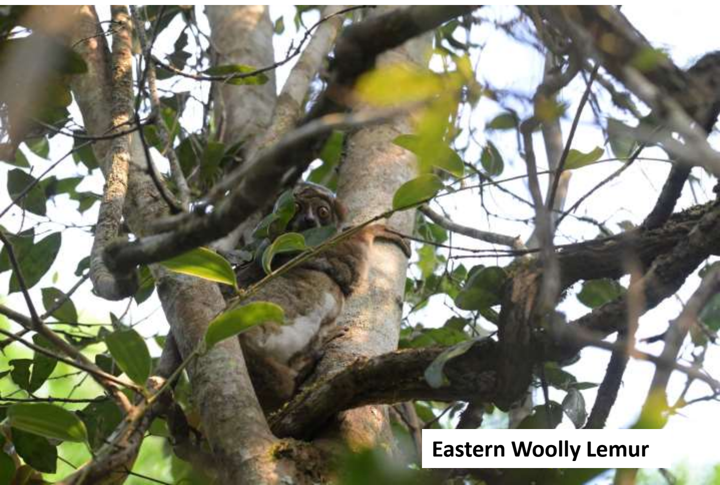
Eastern Woolly Lemur

The threat of rain overnight made me put the moth trap in the veranda of our hotel room, but here the ants were quickly in action eating the moth trap and despite catching loads of moths including a brief visit by a very large moth (but I could not catch it, just got a quick photo) I closed the trap early.