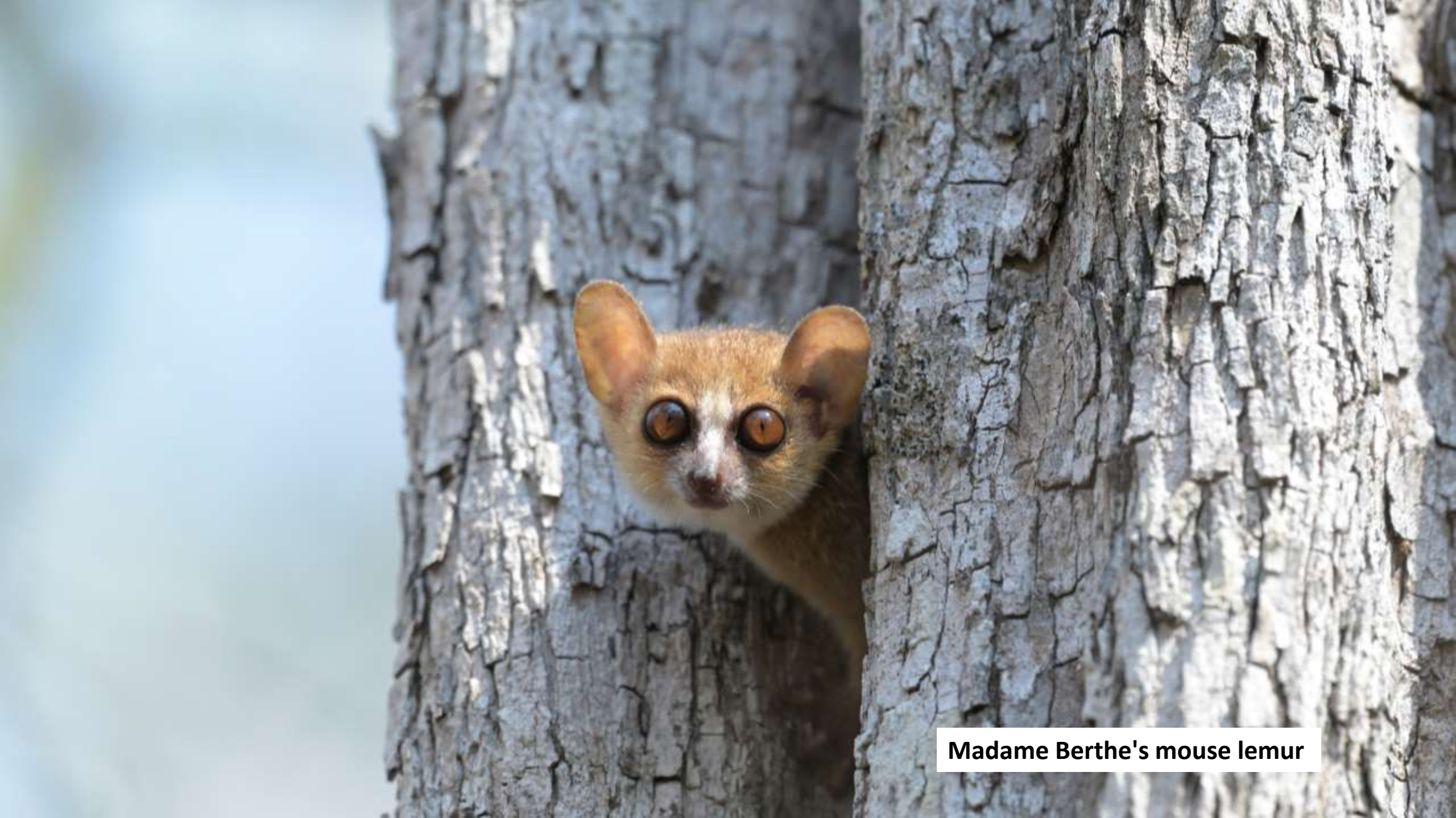
Madame Berthe's mouse lemur