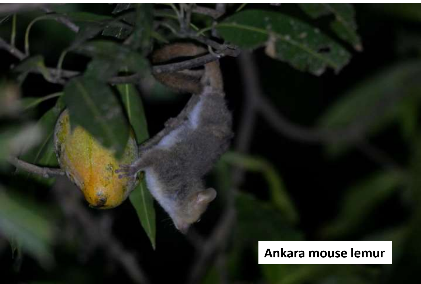
Ankara mouse lemur

The moth trap was overcome with flying ants but still held a few nice moths