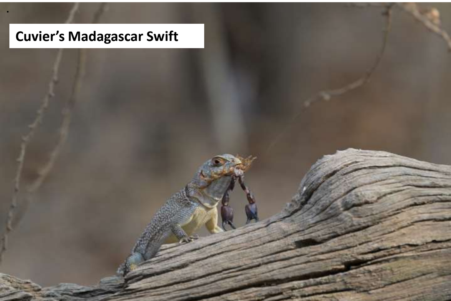
Cuvier's Madagascar Swift

I set the moth trap up away from my room to hopefully avoid the ants and what a move it was buzzing with moths including several large hawkmoths but also plenty of other insects such as mole cricket, hissing cockroach, Rhinoceros beetle and many more.