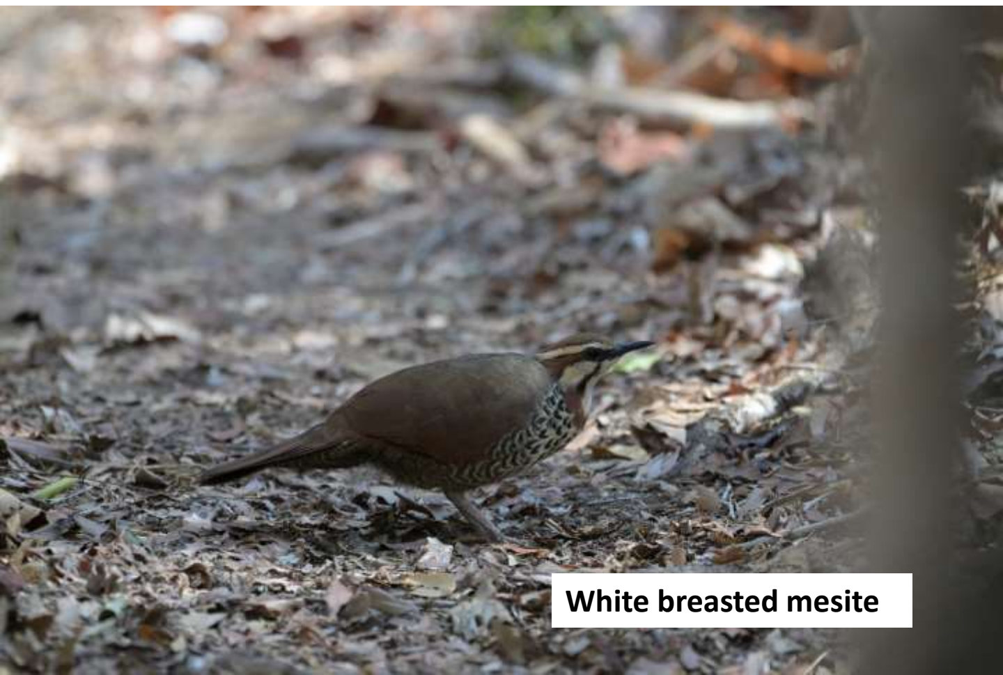
White breasted mesite

We missed a few species, Omuras whale and whale sharks and Montagne d'Ambre fork marked lemur were the obvious misses but we were pretty satisfied with the trip.