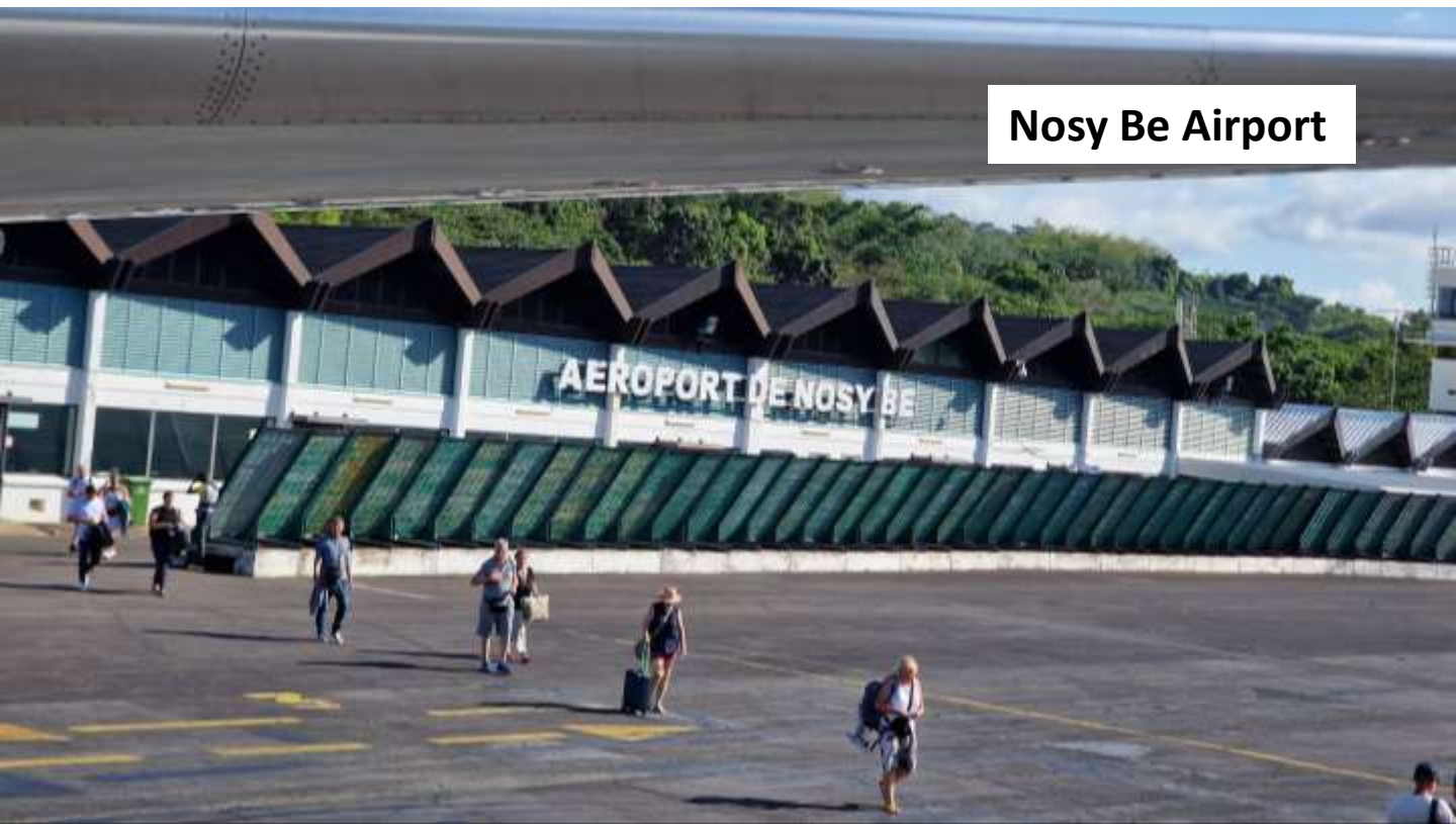
Nosy Be Airport

We had a lunchtime transfer to Nosy Be airport to fly home.