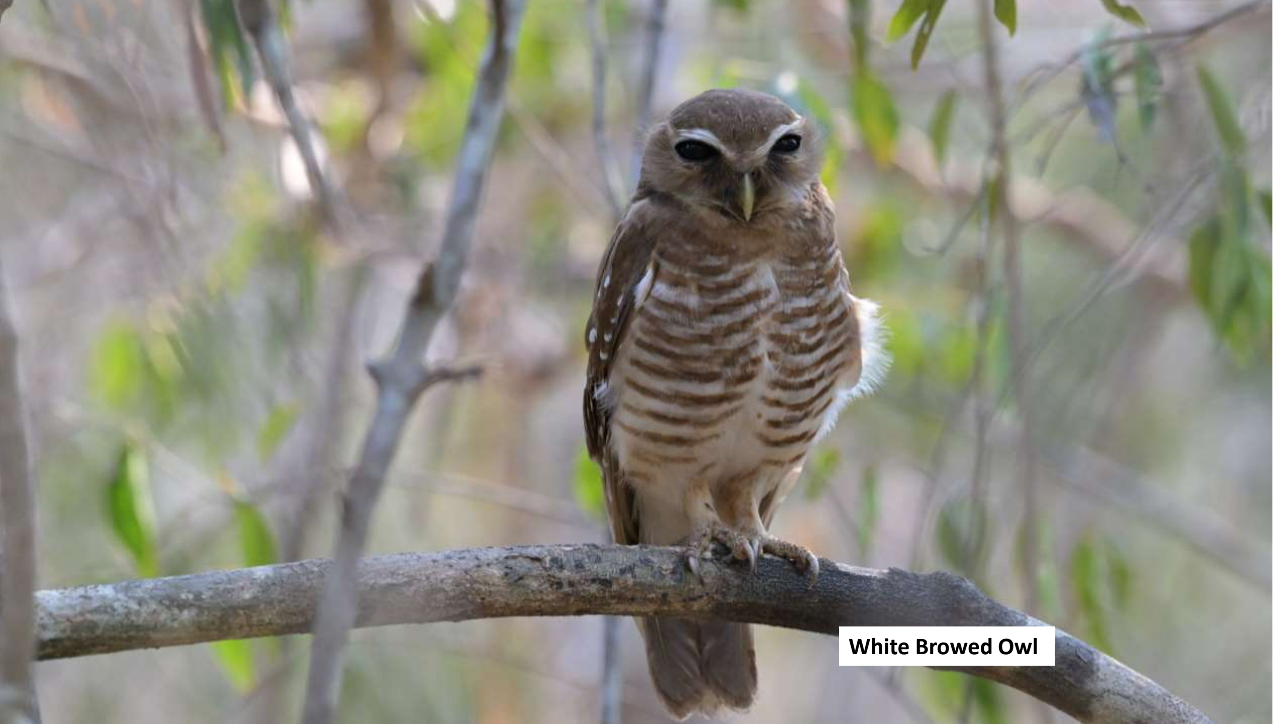
White Browed Owl