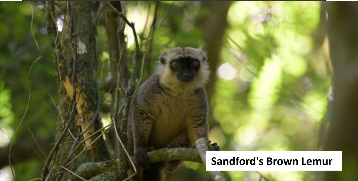
Sandford's Brown Lemur