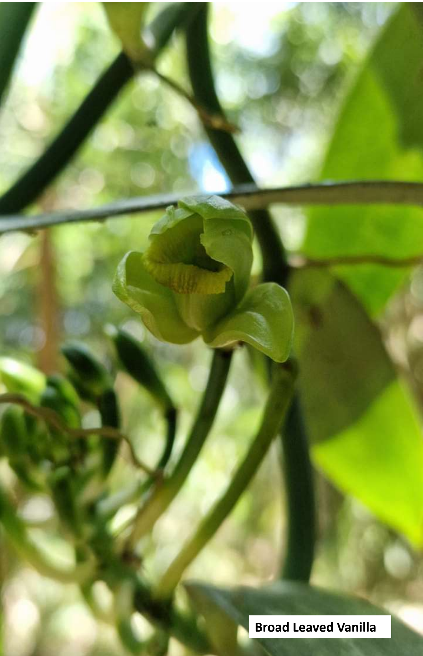
Broad Leaved Vanilla