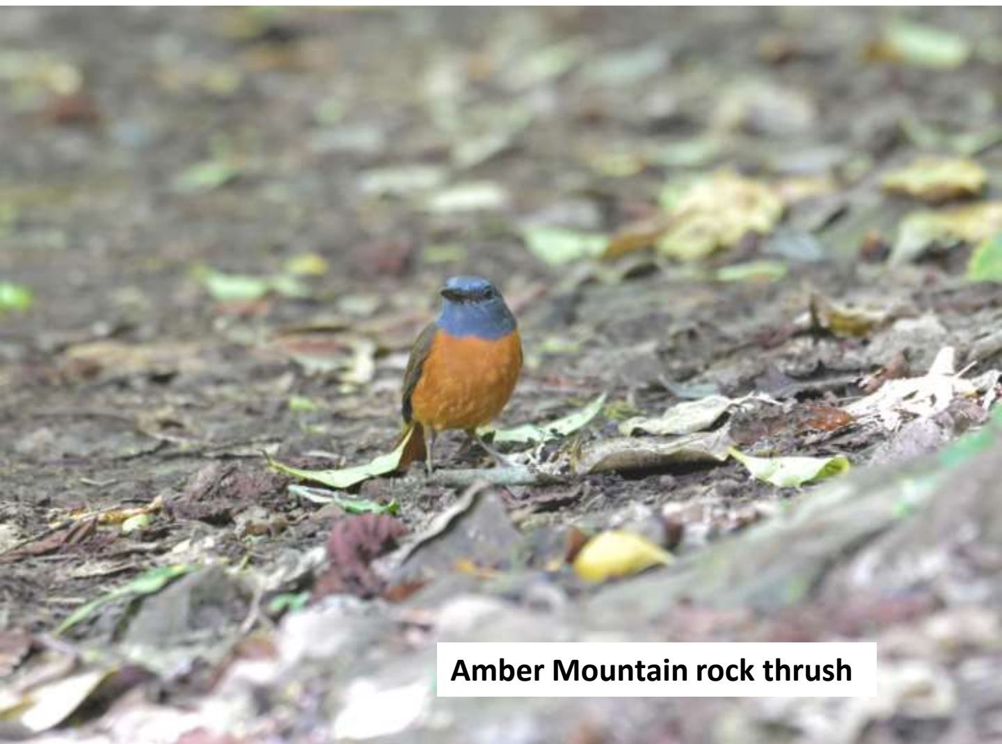
Amber Mountain rock thrush

There is no night access to the reserve but we went to the entrance gate for a night walk at the edge of the reserve we quickly found a Montagne d'Ambre Mouse lemur and plenty of chameleons including the rather strange blue nosed chameleon. We had several mouse lemurs and eventually a couple of Montagne d'Ambre dwarf lemurs. A few black rats rounded off the walk and a brown rat joined us for dinner on the veranda.