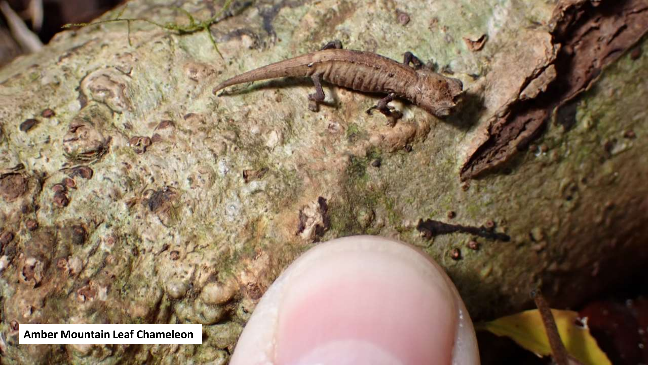
Amber Mountain Leaf Chameleon