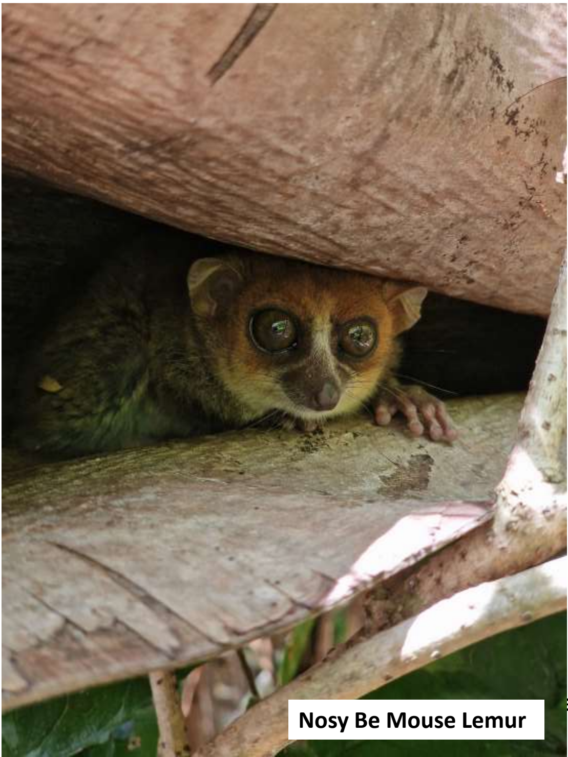
Nosy Be Mouse Lemur

Moth trapping was poor mostly beetles and flying ants.