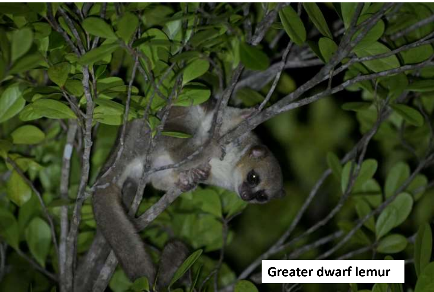
Greater dwarf lemur

I had placed the moth trap in a different location and the location was a good site with no ants and quite a few moths.