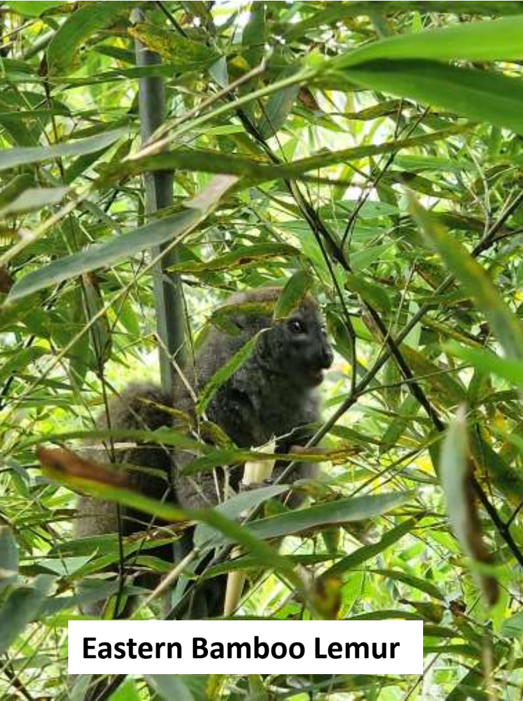
Eastern Bamboo Lemur

Finally a cooler morning, even a few spots of rain to start our walk in Analamazaotra. We quickly found an Eastern Bamboo Lemur and Madagascar tree boa and finally got good views of Red Fronted Coua and plenty of other birds. We also saw Indri, Common Brown lemur, Diademed sifaka, free Madagascar frog and a Madagascan Scops Owl.