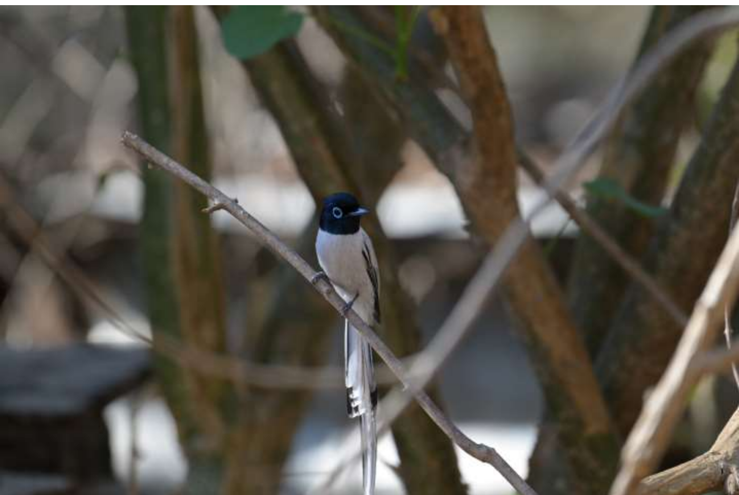
Madagascar Paradise Flycatcher