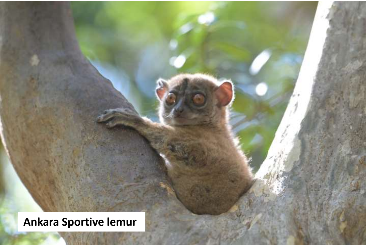
Ankara Sportive lemur

An incredible hot start and long walk with several Ankarana sportive lemurs and good views of both Greater and Lesser vasa parrots and sickle billed vanga. The scenery was amazing and we explored the limestone Tsingy but it was pretty exhausting in the heat and by early afternoon we were ready for some cool drinks.