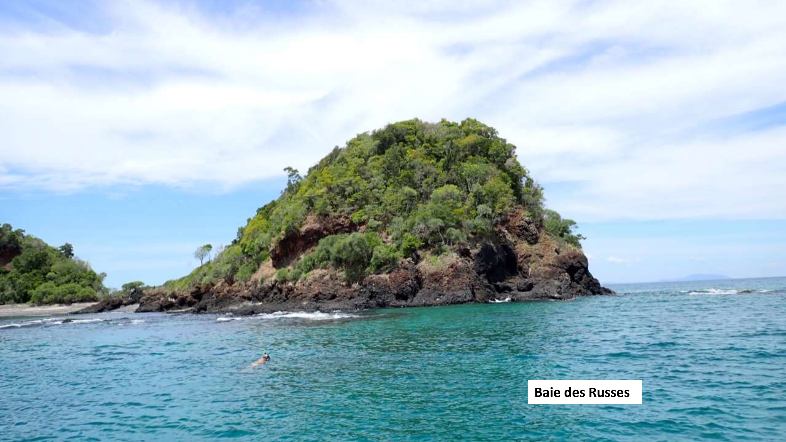
Baie des Russes