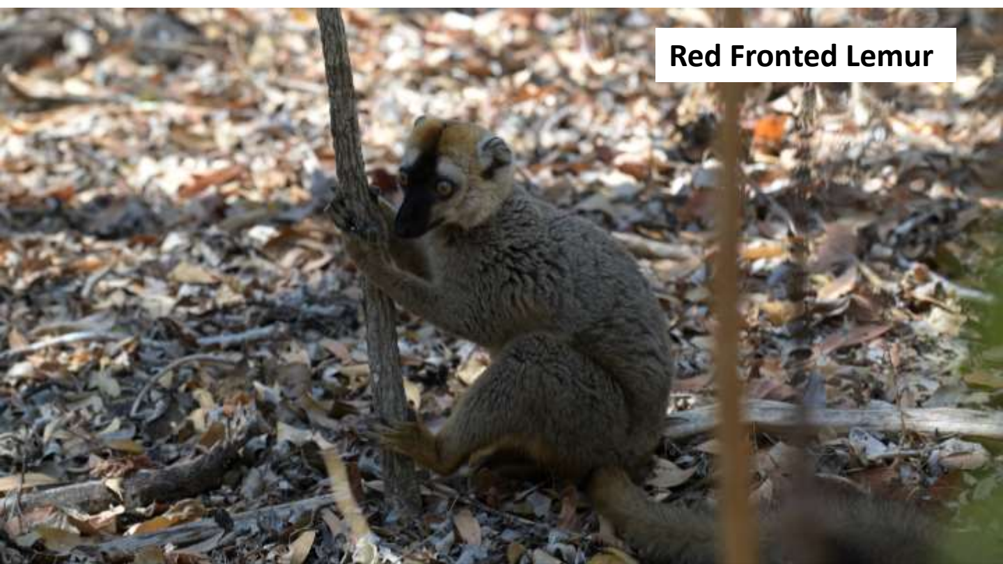
Red Fronted Lemur

We visited the Avenue of the Baobabs in the afternoon and evening but cloud cover prevented a spectacular sunset, much to the disappointment of the assembled crowd. We went to our hotel in Morondava and learned that our lunchtime flight had been brought forward to 8am.