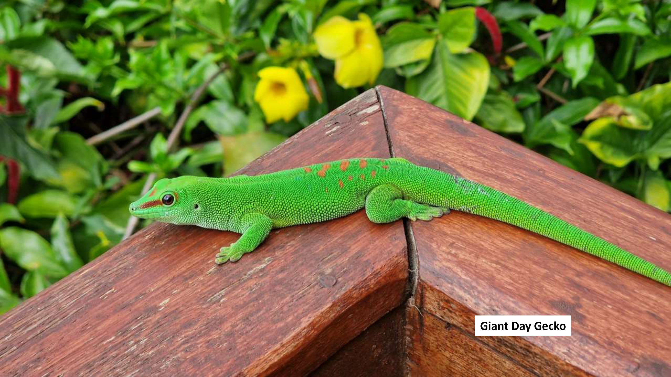
Giant Day Gecko