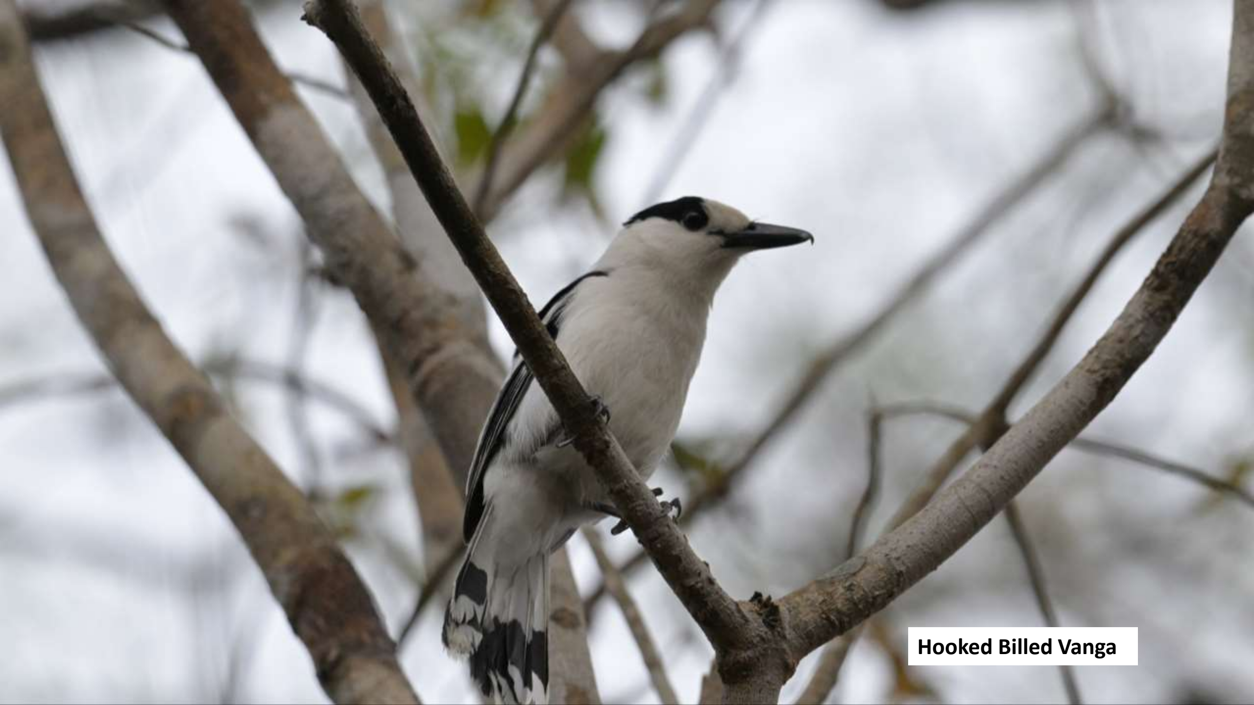
Hooked Billed Vanga