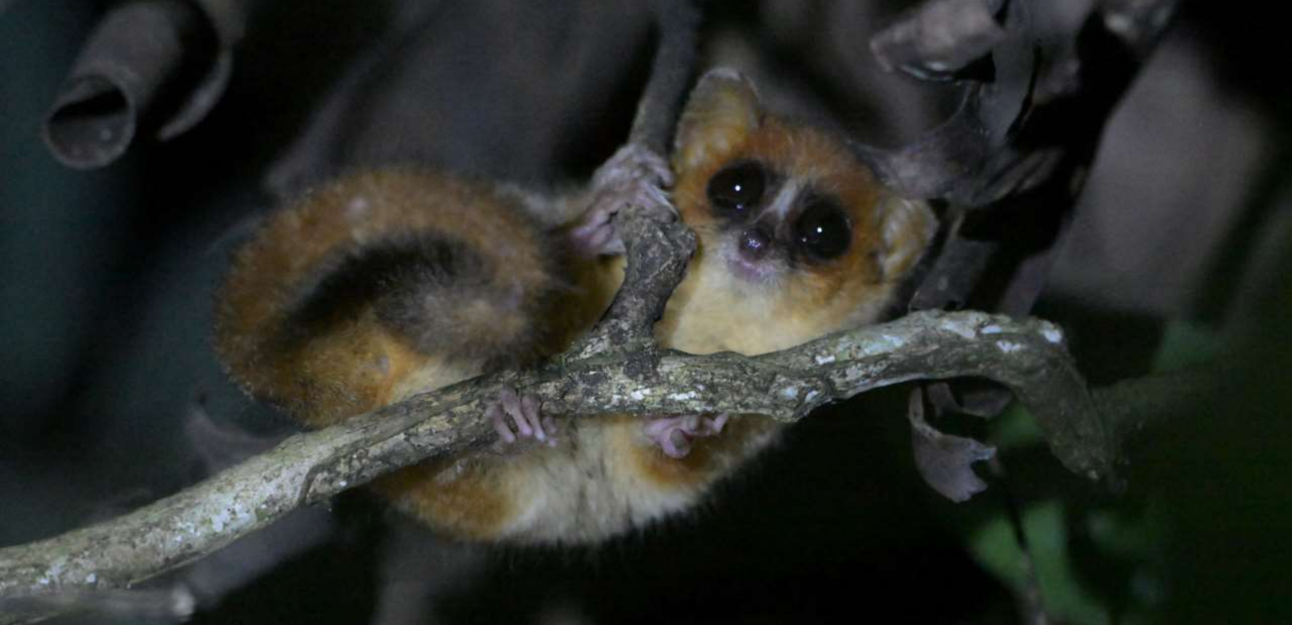
Goodman's Mouse Lemur