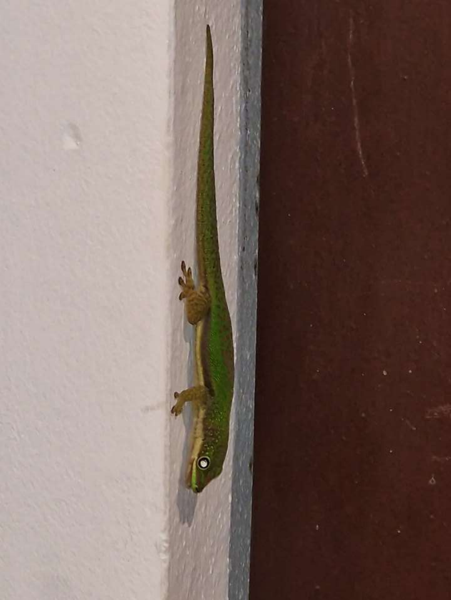
Lined Day Gecko

We arrived at Antananarivo airport pretty much on time early afternoon, we collected our luggage, got visas etc. fairly smoothly, changed some money, collecting millions of Airy in 20,000 notes, trying to get smaller notes was not easy. We were met by our driver and guide and transferred to our hotel.