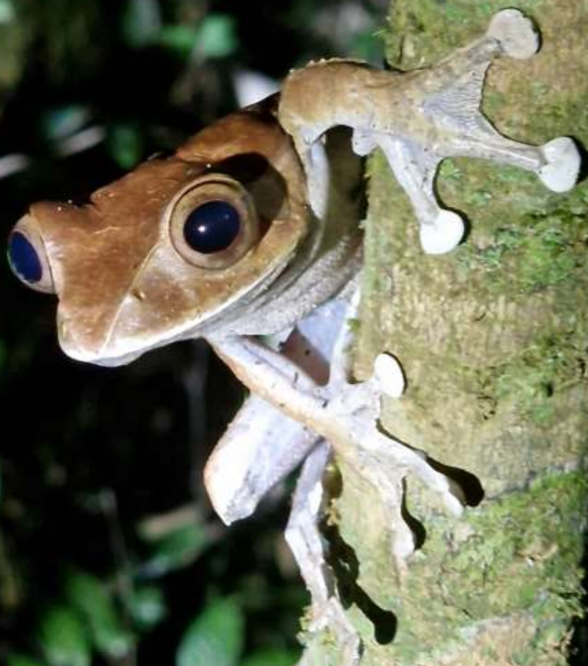
White lipped Bright Eyed Frog